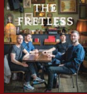
Returning to the Max