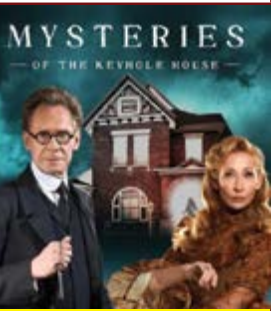
Returning to the Max