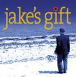
Returning to the Max