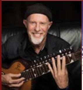
NEW to the Max