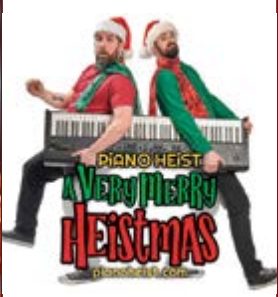
Returning to the Max