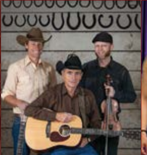
Returning to the Max