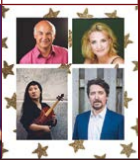
NEW to the Max

Watch for dates and tickets sale starting in June 2025