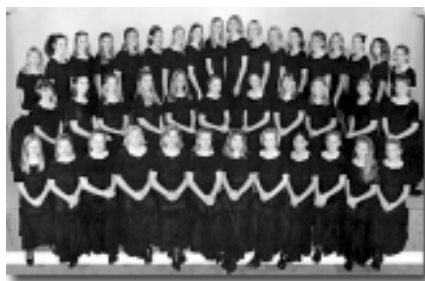
From top Iowa Youth Chorus; Fredericksburg Children's Chorale

Information accurate at time of printing. Program subject to change.